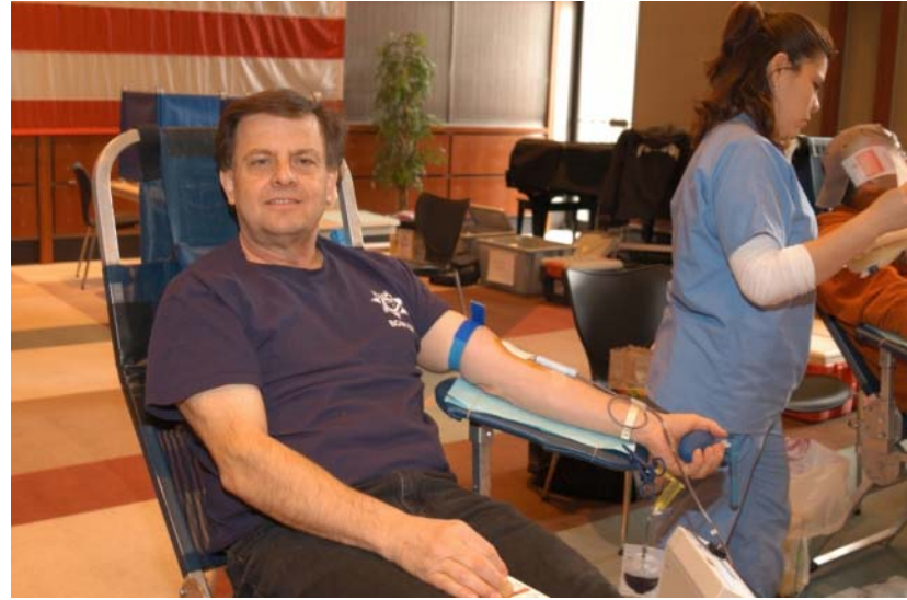
County Sheriff whose son left for Afghanistan 2 days after he donated blood