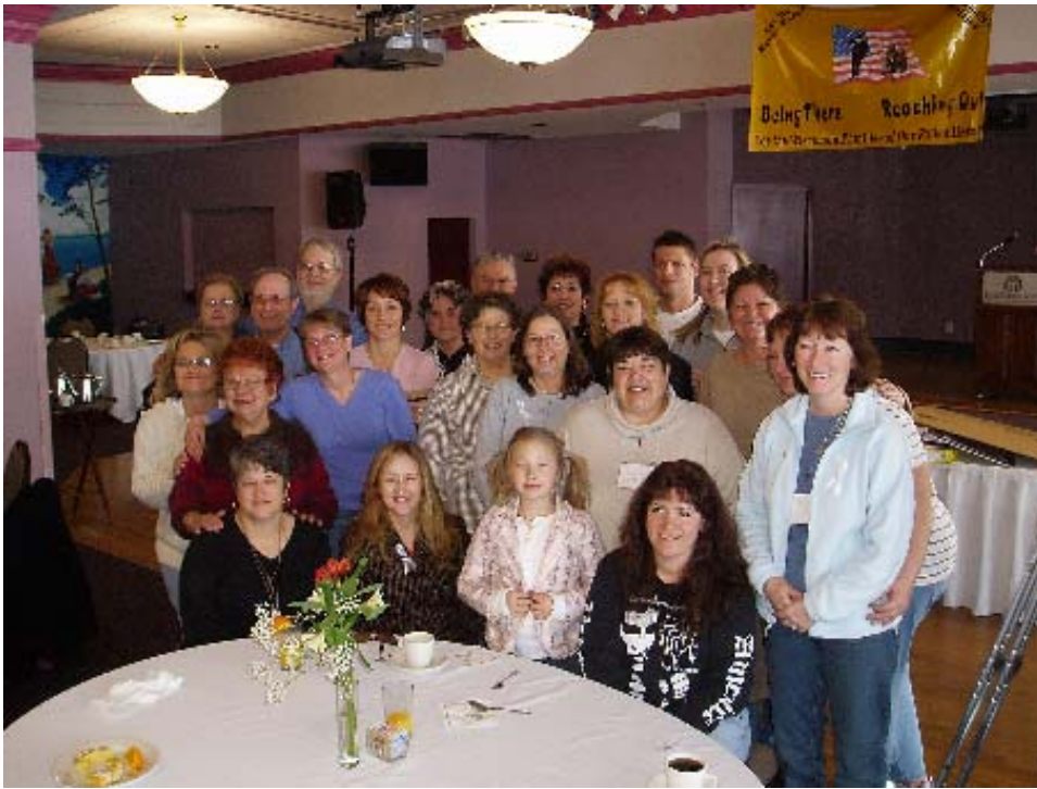
Part of the Gold Star Family Breakfast Club, obviously they're all full!