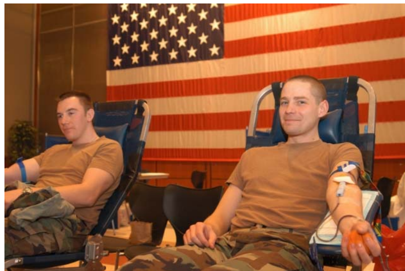
Serving in more ways than one. God Bless them.